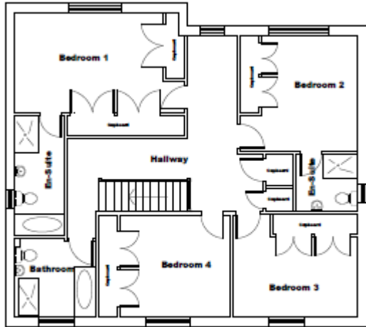
Existing First Floor Plan

The floor plan examples are of a loft conversion project in Glasgow. This loft conversion allowed for a self-contained living space in the loft. This project was of a very complex design nature, which involved extensive Structural engineering input due to the clients specific design brief.